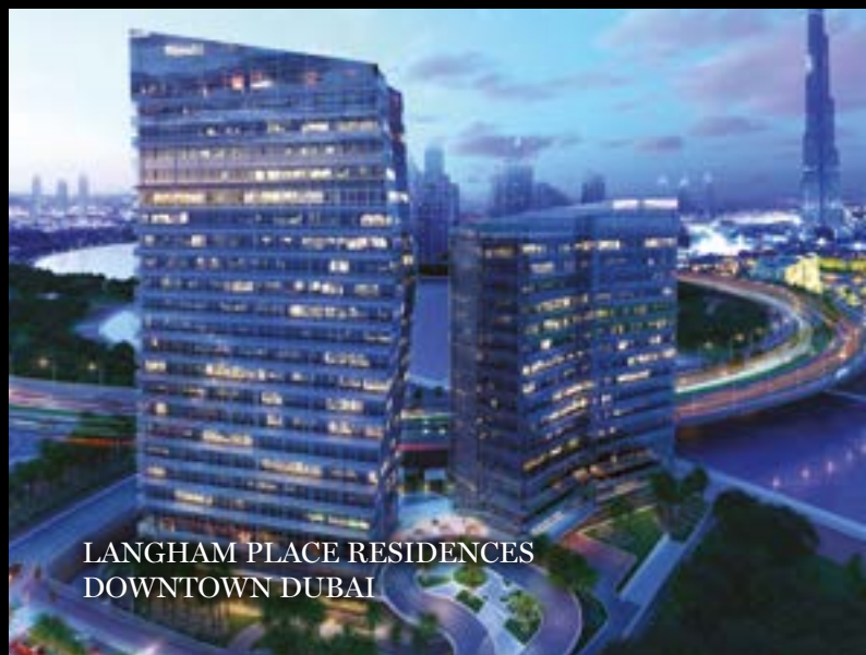
LANGHAM PLACE RESIDENCES DOWNTOWN DUBAI

One of the most visionary real-estate development and service groups in the Gulf Region, Omniyat creates living canvases of residential, commercial, hospitality and retail spaces – a one-of-a-kind premium experience. We approach the design, development and management of each Omniyat property as if it were a unique work of art. Just as there is no mistaking a Picasso or a Van Gogh, there is no mistaking that you are anywhere but in an Omniyat property.