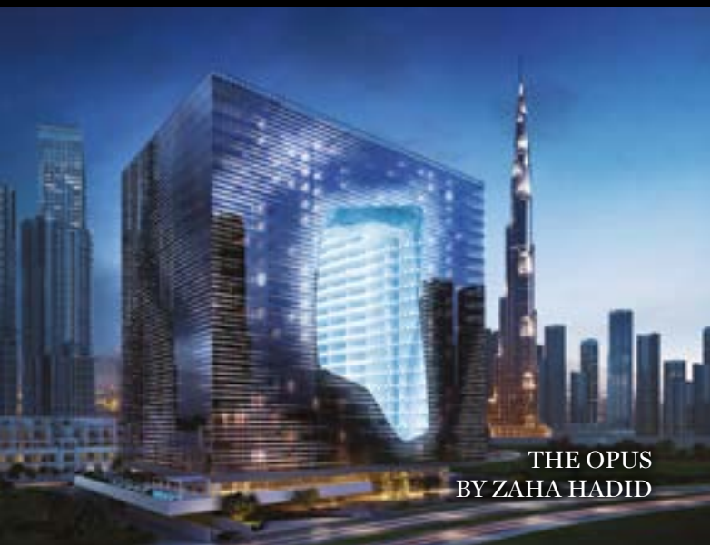
THE OPUS BY ZAHA HADID