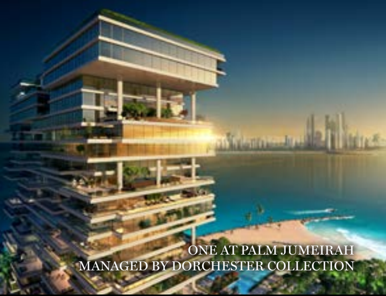
ONE AT PALM JUMEIRAH MANAGED BY DORCHESTER COLLECTION